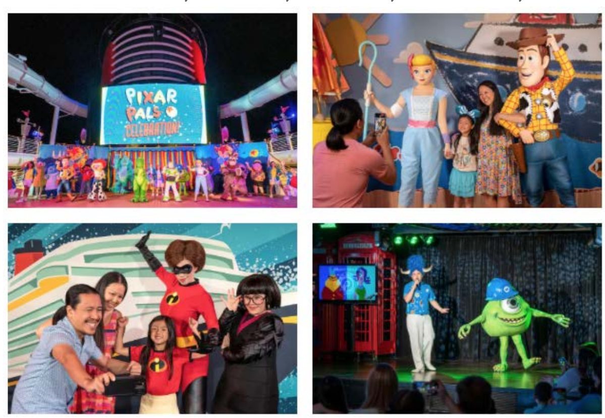
Pixar Day at Sea will be offered on nine seven-night Caribbean cruises aboard the Disney Fantasy sailing from Port Canaveral, Florida.